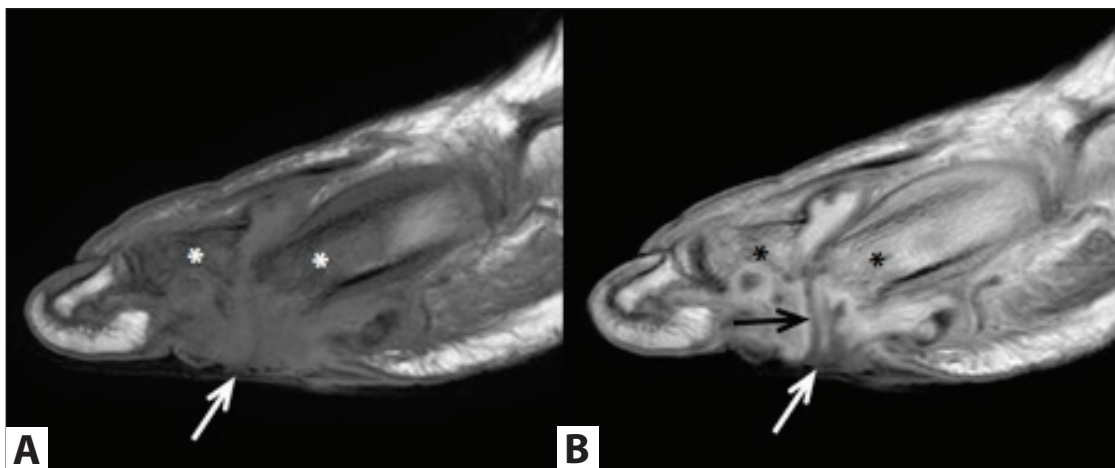
Figure 2. Skin ulcer (white arrows) on the plantar side of the first metatarsophalangeal joint on pre (A) and postcontrast (B) T1-weighted images in the sagittal plane, signal intensity changes consistent with osteomyelitis in the first metatarsal and proximal phalanx, and contrast enhancement (asterixes) and sinus tract extending into the joint space (black arrow) are observed.